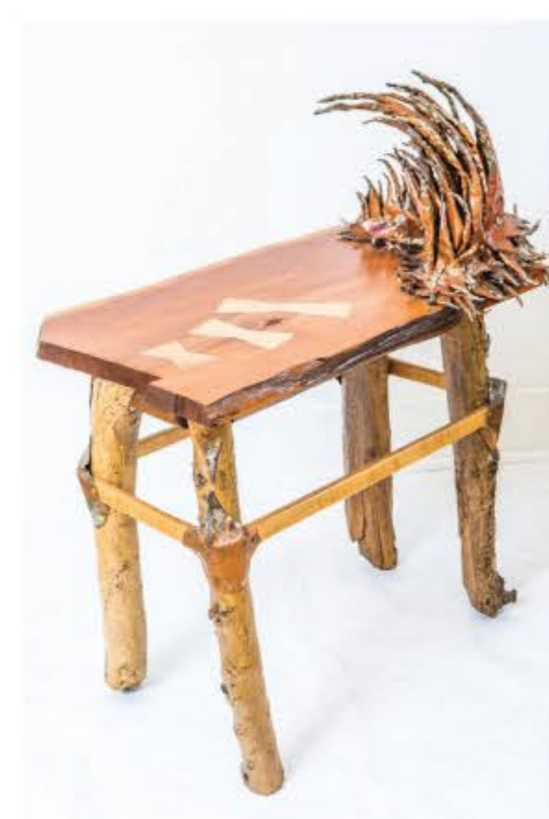
In 2011 Sheehan began creating furniture/sculpture hybrids using wood, metal and found objects.

For more information on Sheehan's work, visit rosssheehanart.com . HALF MOON BAY