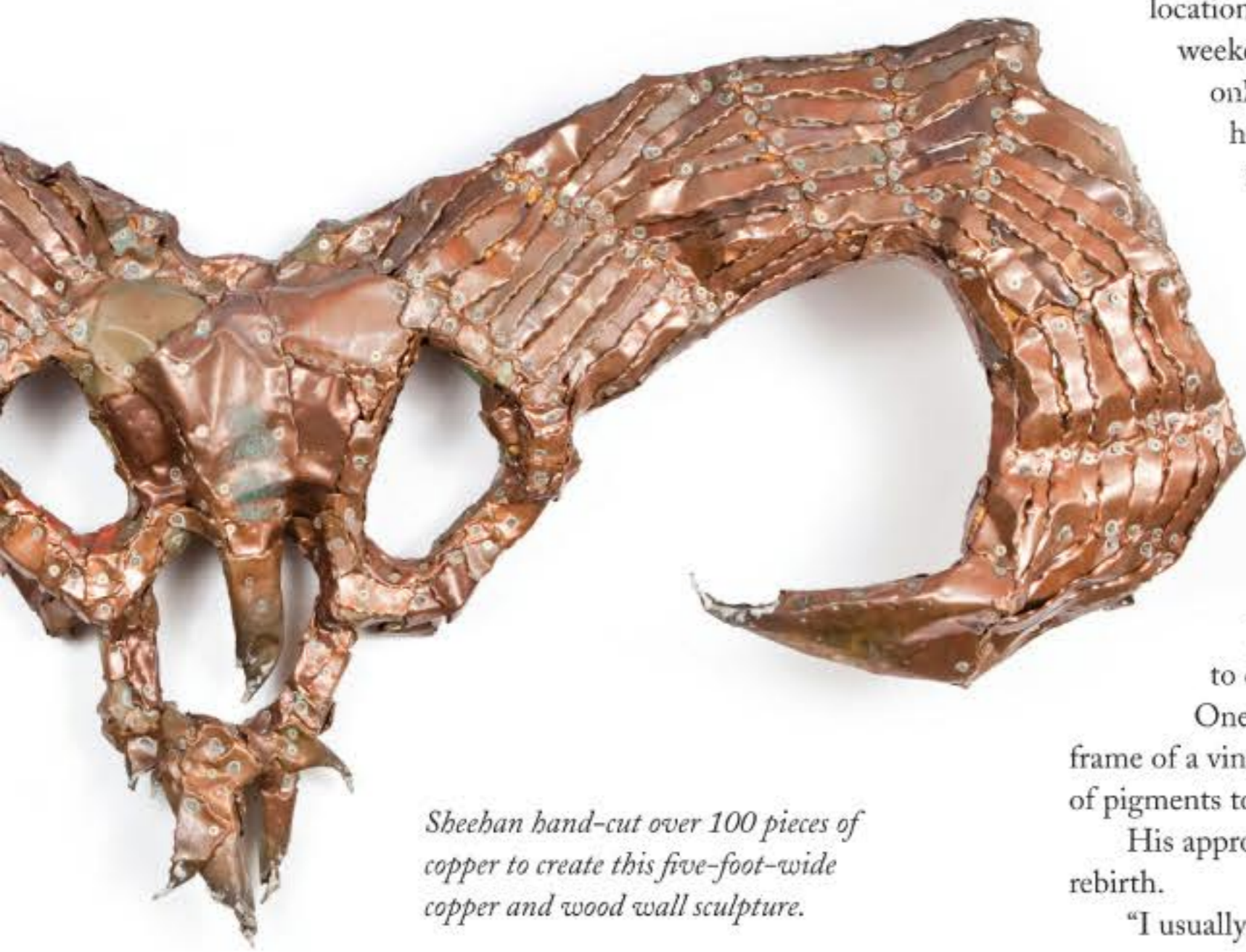
Sheehan hand-cut over 100 pieces of copper to create this five-foot-wide copper and wood wall sculpture.

By Sarah Griego Guz